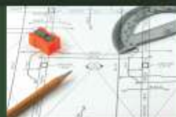
Design & Engineering