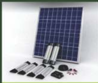
Solar home lighting system