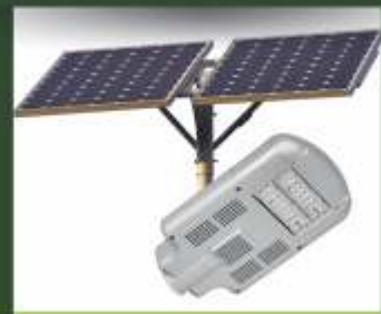
Solar street light (LED)