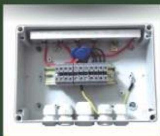
AJB & ACDB