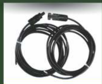
Solar Accessories & cables