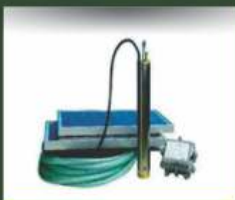
Solar PV pumps for drinking water & irrigation